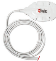
TFA-1® Forehead Sensor