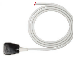
TF-I® Forehead Sensor