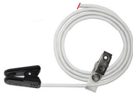
TC-I Ear Sensor