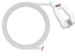
E1® Ear Sensor