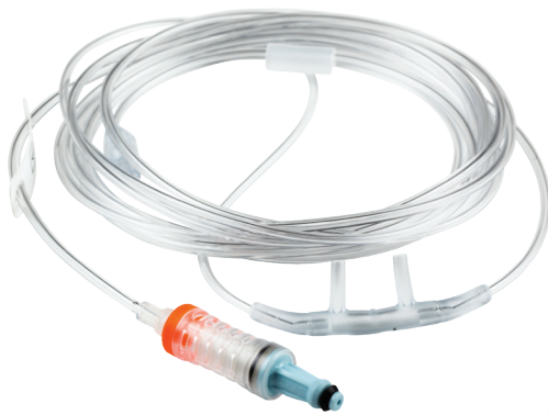
NomoLine LH Adult Nasal Cannula

No-moisture sampling lines for intubated and non-intubated patients in low- and high-humidity applications