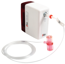
The NomoLine Airway Adapter Set connects to the ISA module

Root capabilities expand with the ISA™ family of modules to include real-time capnography and gas measurements