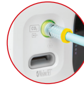
Light Emitting Gas Inlet (LEGI) indicator changes color to indicate if the NomoLine sampling line is correctly connected or occluded