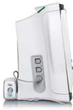
ISA module easily mounts to the back of the Root and connects via the MOC-9 ports on the side