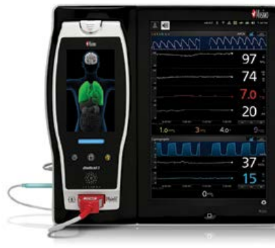
Root capabilities expand with ISA to include real-time capnography and gas measurements