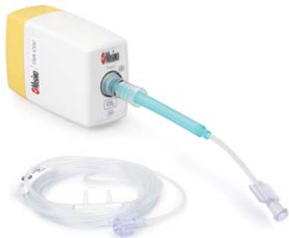
Nomoline adapter with cannula is plugged into the ISA module

The ISA™ module with Nomoline sampling lines connect to the Root® patient monitoring platform via Masimo Open Connect™ (MOC-9™) ports.