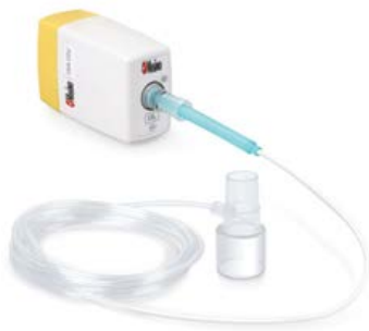
Nomoline airway adapter set is plugged into the ISA module

The ISA™ module with Nomoline sampling lines connects to the Root® patient monitoring platform via Masimo Open Connect™ (MOC-9™) ports.