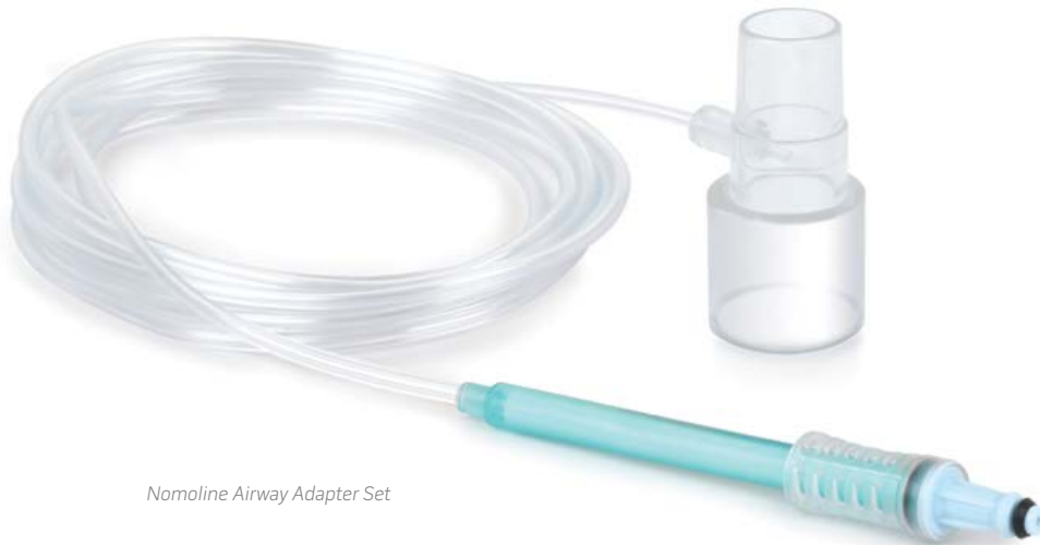
Nomoline Airway Adapter Set

No moisture sampling for extended monitoring of intubated patients