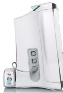
ISA module easily mounts to the back of the Root and connects via the MOC-9 ports on the side