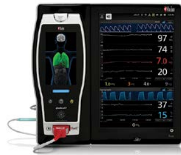
Root capabilities expand with ISA to include real-time capnography and gas measurements